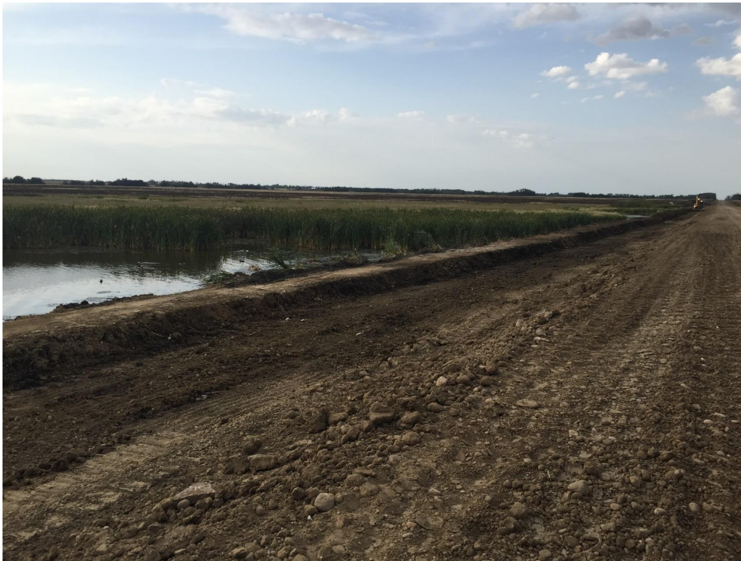
Range Road 211