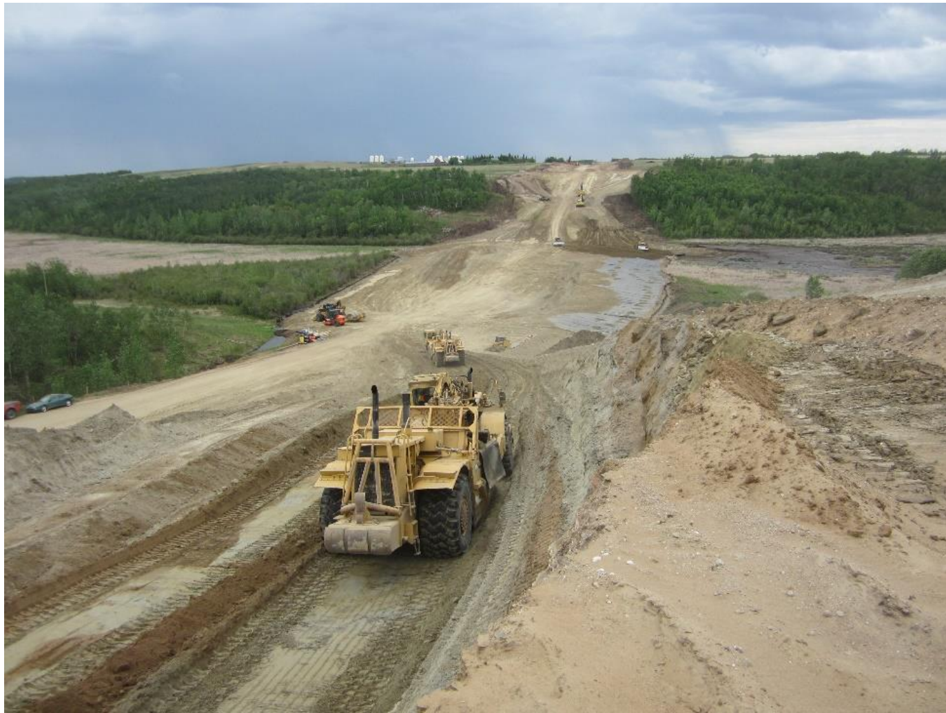
GRATTON COULEE ROAD