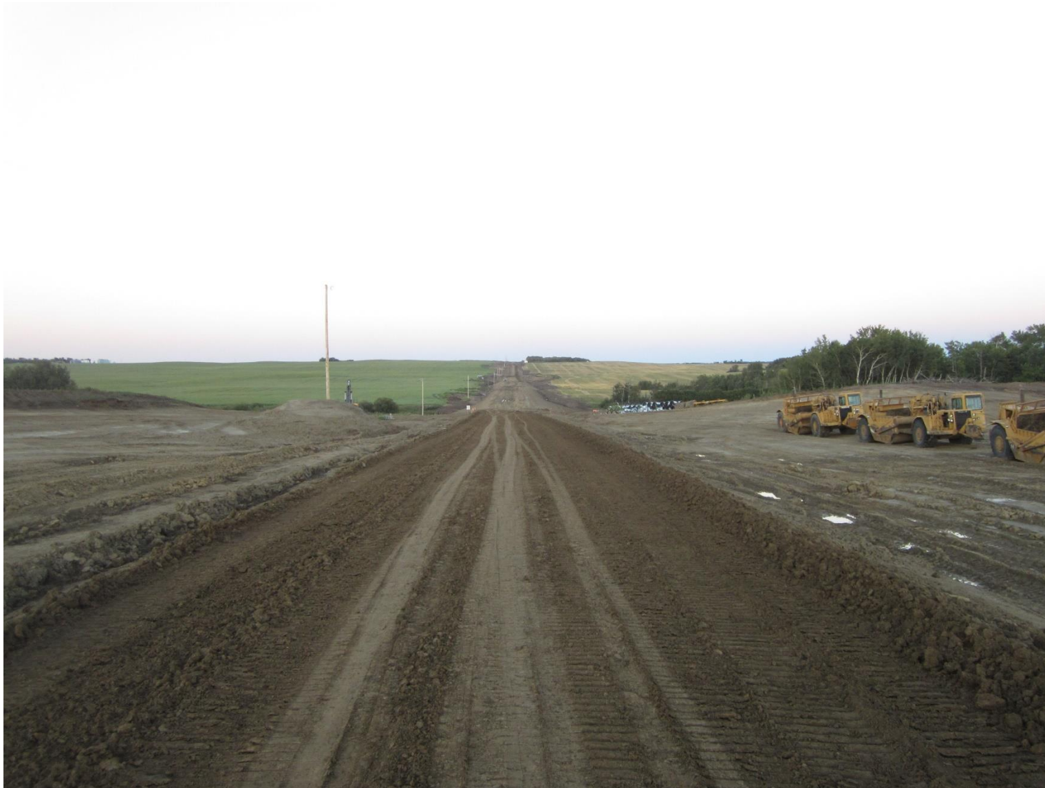
HOGAN HILL ROAD