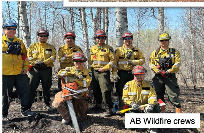
AB Wildfire crews