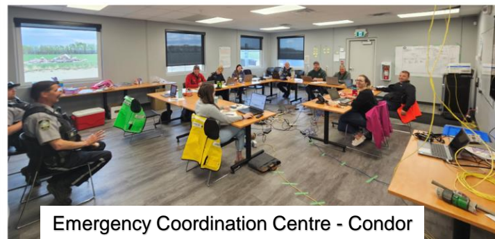
Emergency Coordination Centre - Condor