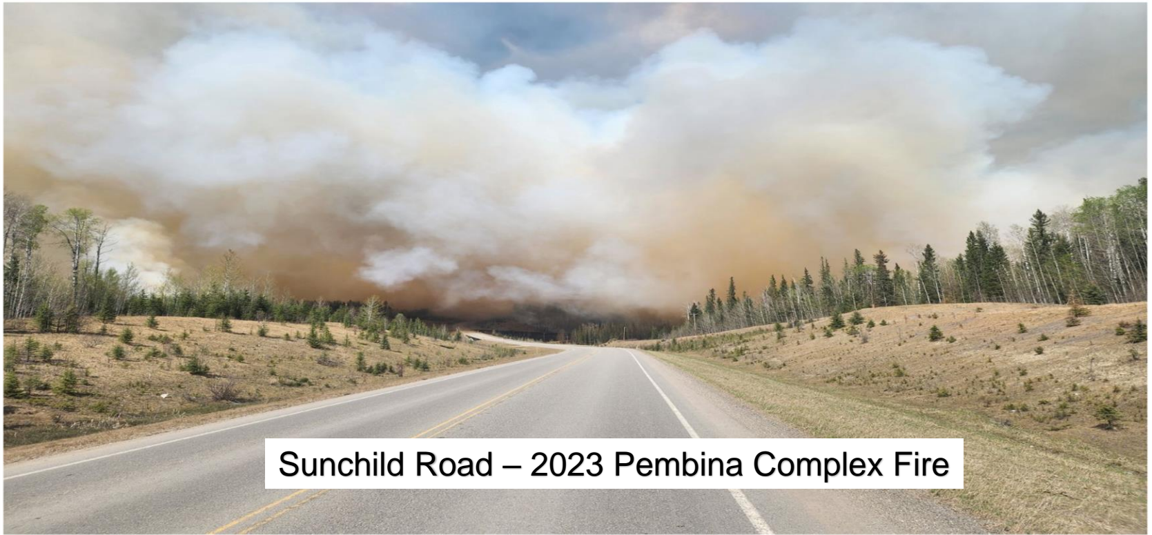
Sunchild Road – 2023 Pembina Complex Fire