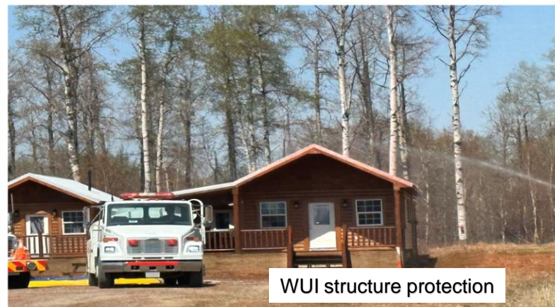
WUI structure protection