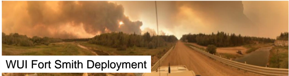
WUI Fort Smith Deployment