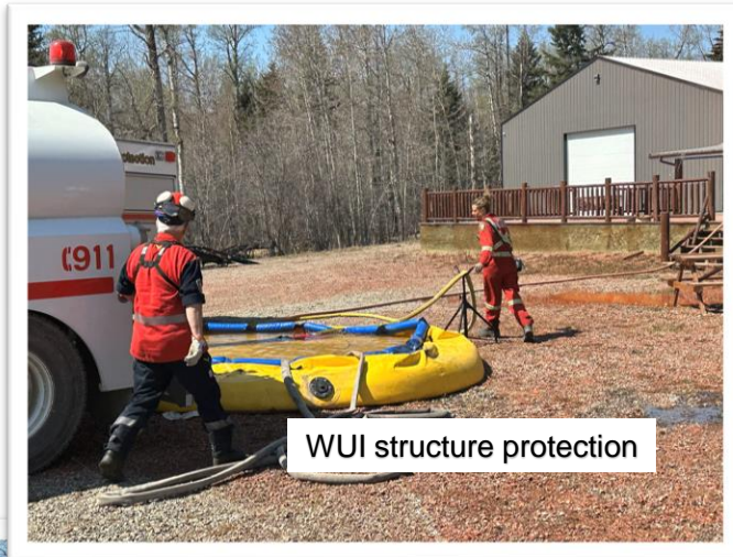
WUI structure protection