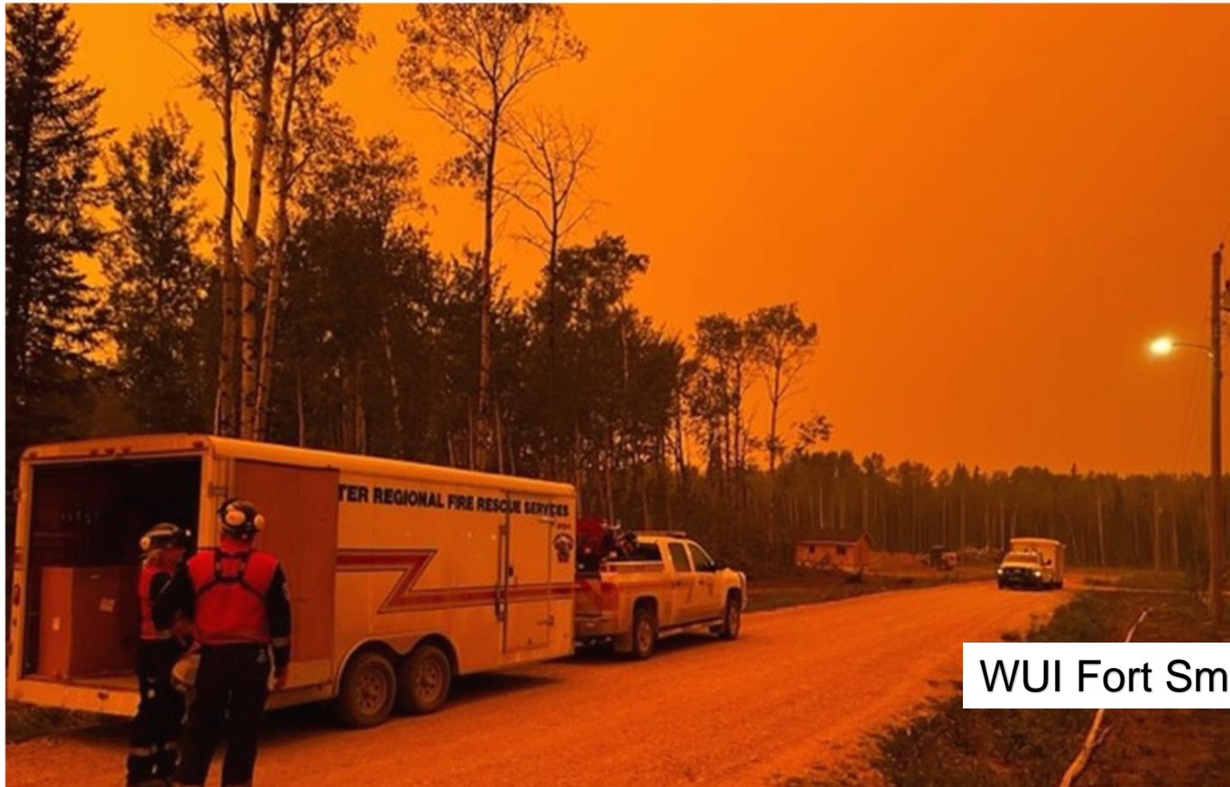
WUI Fort Smith Deployment