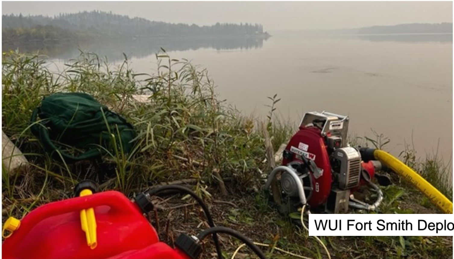
WUI Fort Smith Deployment