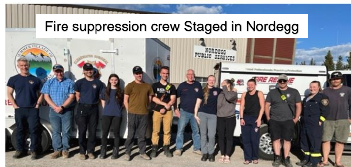
Fire suppression crew Staged in Nordegg